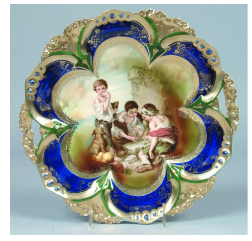
Lot 241 RS Prussia Cake Plate, 11"d.; Mold 82; Dice Thrower SOLD: $4000