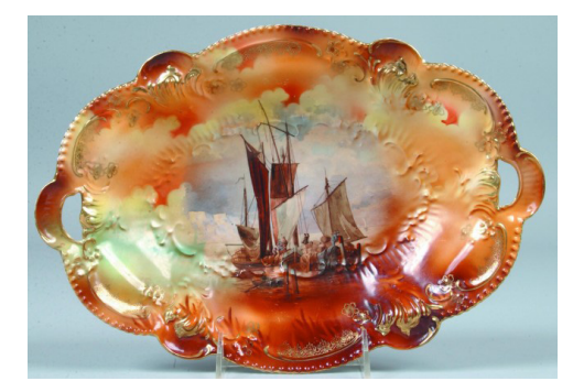
Lot 241 RS Prussia Cake Plate, 11"d.; Mold 82; Dice Thrower SOLD: $4000