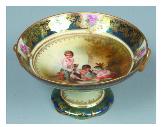
Lot 49 RS Prussia/Suhl Compote, 2.75"h. X 5.75"d., Dice Throwers SOLD: $950