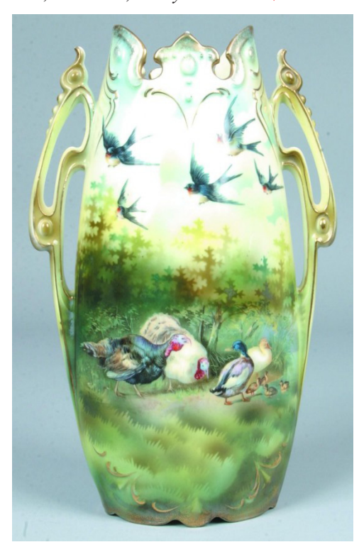
Lot 70 RS Prussia Vase, 12"h., Mold 938; Barnyard SOLD: $800