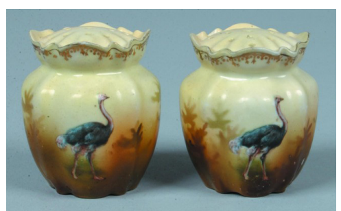
Lot 148 RS Prussia Salt and Pepper, 2.5"h.; Mold 508; Bird SOLD:$350