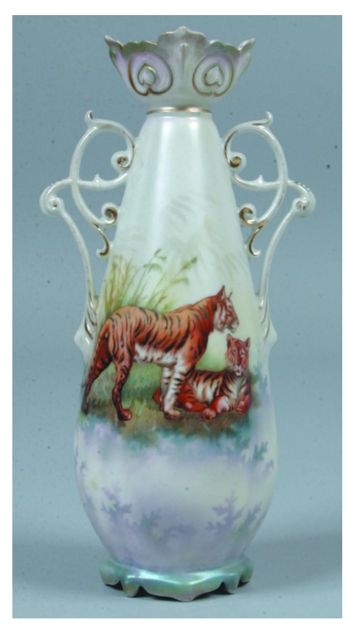
Lot 235 RS Prussia Vase, 10.25"h.; Mold unknown, teardrop SOLD:$3750