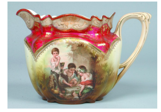
Lot 32 RS Prussia Cider Pitcher, 6.5"d.x 6"h., Mold 508 SOLD: $600