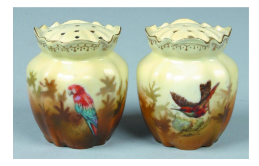
Lot 12 RS Prussia Salt & Pepper, 2"d x 2.5"h, Mold 540a SOLD:$350