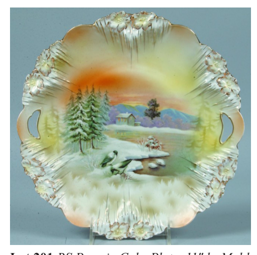
Lot 201 RS Prussia Cake Plate, 11"d.; Mold 7, icicles; Snowbird SOLD:$800