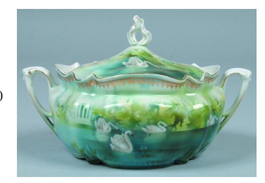
Lot 7 RS Prussia Swan Covered Biscuit Jar, 7"d x 5.75"h, Mold SOLD:$550

All in all, it appears that prices for RS Prussia may have turned the corner, at least for the high-end pieces. ★