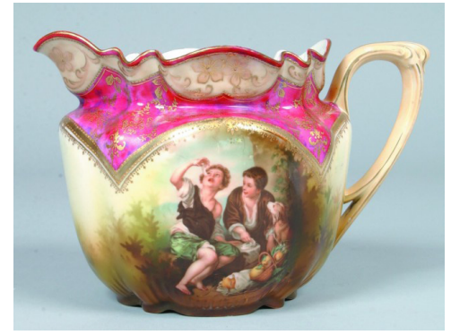
Lot 312 RS Prussia Cider Pitcher, 6"h. x 6.75"d.; Mold 540 SOLD:$550