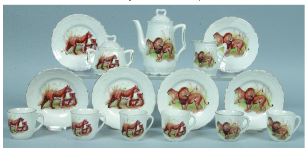
Lot 365 RS Prussia 15piece Child's Tea Set, Pot: 4.25"h., Lions & Tigers SOLD:$4,000