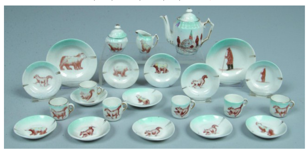
Lot 266 RS Prussia Childs Tea Set, 23pieces; Admiral Peary SOLD:$6500