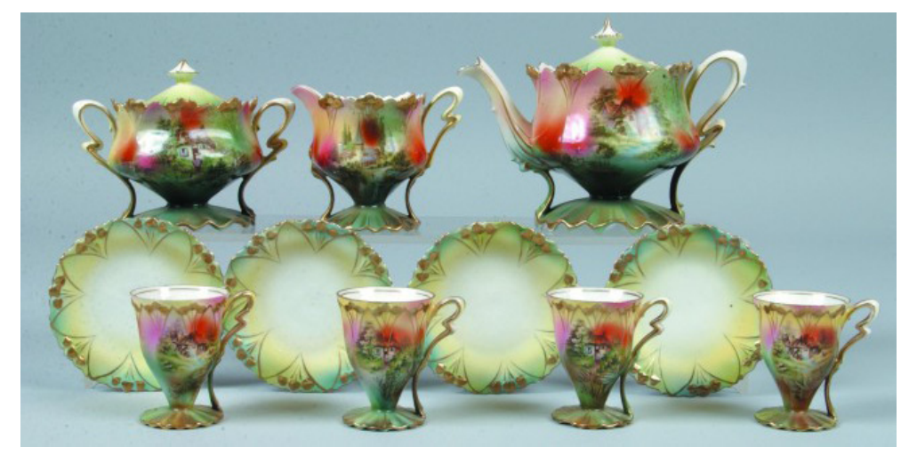
Lot 210 RS Prussia Tea Set, 3"h., 3.25"h., 3.5"h., 4"h.; SOLD: $800