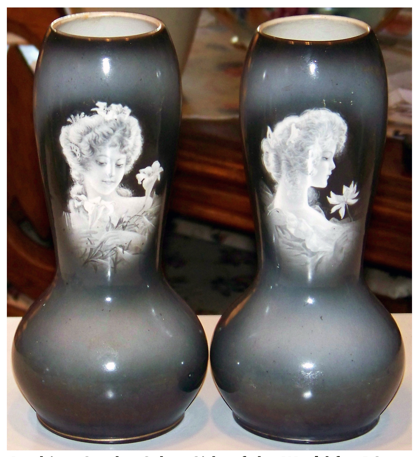
Looking On the Other Side of the World for RS