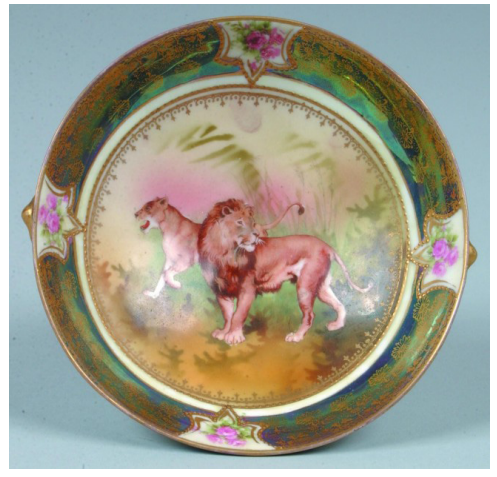
Lot 109 RS Prussia Compote, 2.75"h. x 5.25"d.; Round bowl SOLD:$4,000