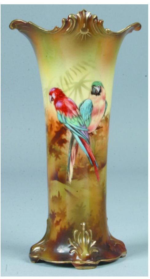
Lot 87 RS Prussia Vase, 9"h.; Mold 727; flared cylinder bottom SOLD: $800