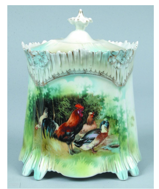
Lot 59 RS Prussia Cracker Jar, 5.5"h. x 6"d., Mold 641, Barnyard SOLD: $550