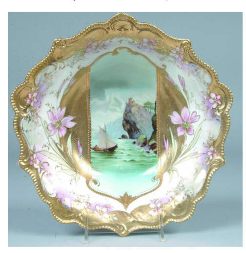
Lot 150 RS Prussia Bowl, 10.75"d.; Mold 304; "Keyhole" SOLD: $1200 DAMAGE