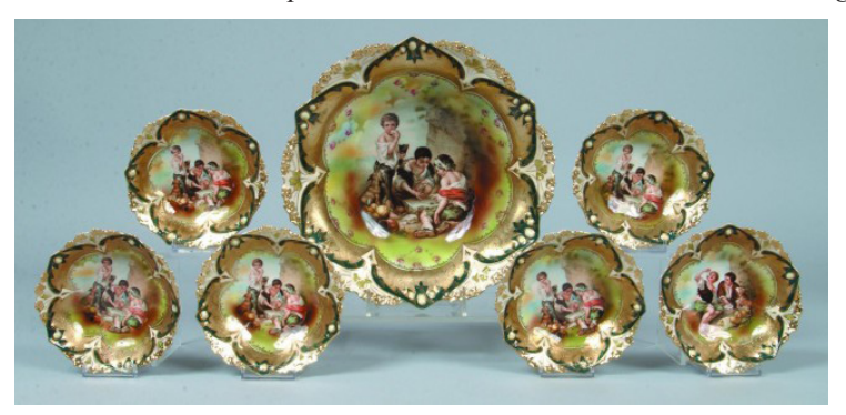
Lot 386 RS Prussia Berry Bowl and 6 Small Bowls, 10.5"d. Dice Throwers SOLD:$3400