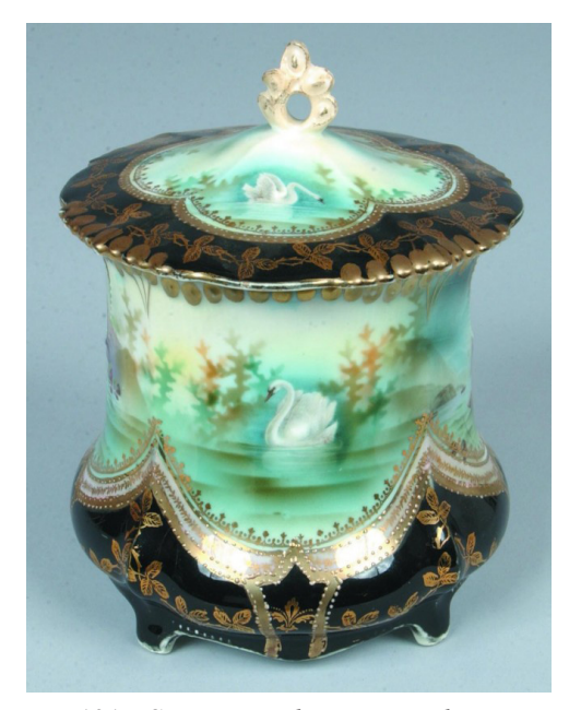
Lot 101 RS Prussia Tobacco Humidor, 5.5"h. x 6"d.; Mold 63 SOLD:$2600